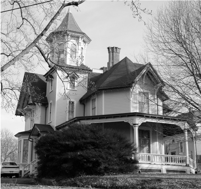
1 Pendleton Place, a 2005 winner

What's your favorite old house on Staten Island? Have you admired an elegant, historically accurate facelift on your walks around town? Or have you been curious about a tattered but proud survivor from the 1800s? Now is the time to make your appreciation known.