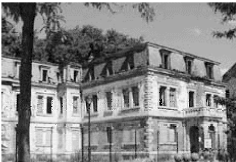
Administration Building on the Lighthouse Museum site

The NYC Economic Development Corporation (EDC) has taken bids to sell off the landmarked administration building and the two adjacent buildings at the site of the National Lighthouse Museum (NLM), next to the Ferry Terminal.